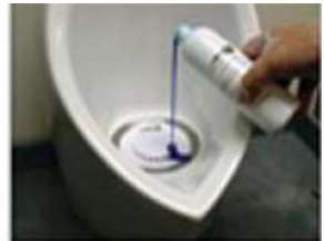
POUR IN ONE 385ML BOTTLE OF ODOUR BARRIER AND WIPE CLEAN BOWL