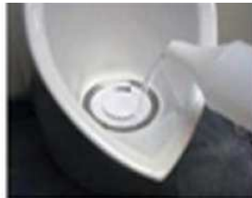
POUR 1 LITRE OF WATER INTO THE URINAL