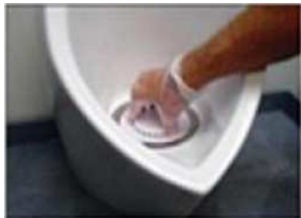
REPLACE THE NEW INSERT, PRESS DOWN UNTIL YOU FEEL AND HEAR A SLIGHT POPPING SOUND