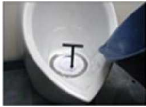
SCREW THE ZEROFLUSH TRAP INSERT REMOVAL KEY INTO THE HOLE OF THE DRAIN INSERT

ZeroFlush has been developed to be the most economical and environmentally-friendly waterless urinal in the world today