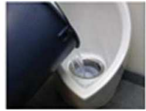
RINSE THE OPEN TRAP WITH WATER