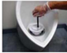
PULL UPWARD ON KEY TO REMOVE INSERT